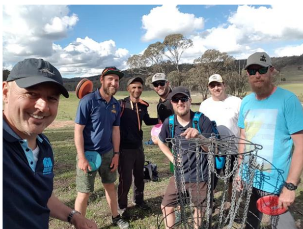
The Royal Molong Challenge

The B tier events: Snowy Mountains Marathon, Splendor in the Basket, Up on Juan, Rathmines Rumble, Jesmond Jam and Dubbo charge all provide excellent tournaments with plenty of locals turning out to play in them. The Dubbo course in particular with the full 18 baskets and river crossing is proving to be one of the states more popular destinations. The follow up casual tournament at Royal Molong is also proving to be a hit with people travelling back to Sydney.